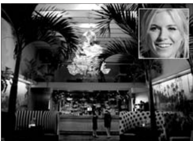
Sienna Miller at Bungalow 8, London