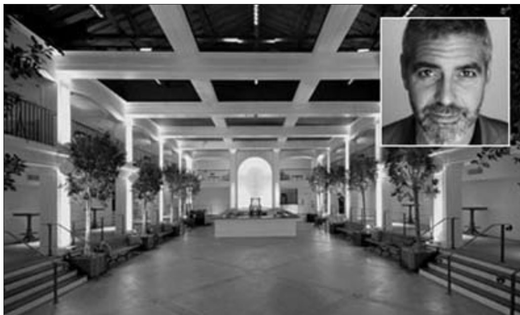
George Clooney has been spotted at BOULEVARD3, Los Angeles