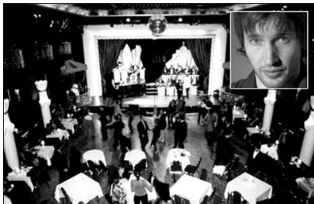
James Blunt at Supper Club, New York and London