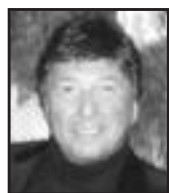
By Scott Grody

In the world of nightlife, lounging is in and dancing is out. And that's particularly true when it comes to the beautiful people.